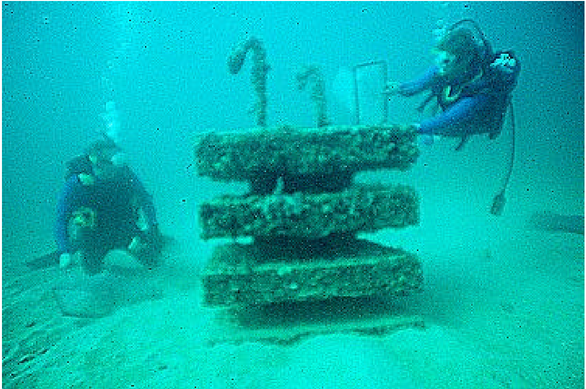
Figure 4. "Fish-condo" module, a cubic meter in size, constructed by filling an external skeleton of waste concrete block with concrete and reinforcing rebar. The design was inspired by the undercuts and overhangs of hard-bottom ledges and outcroppings offshore Broward County.