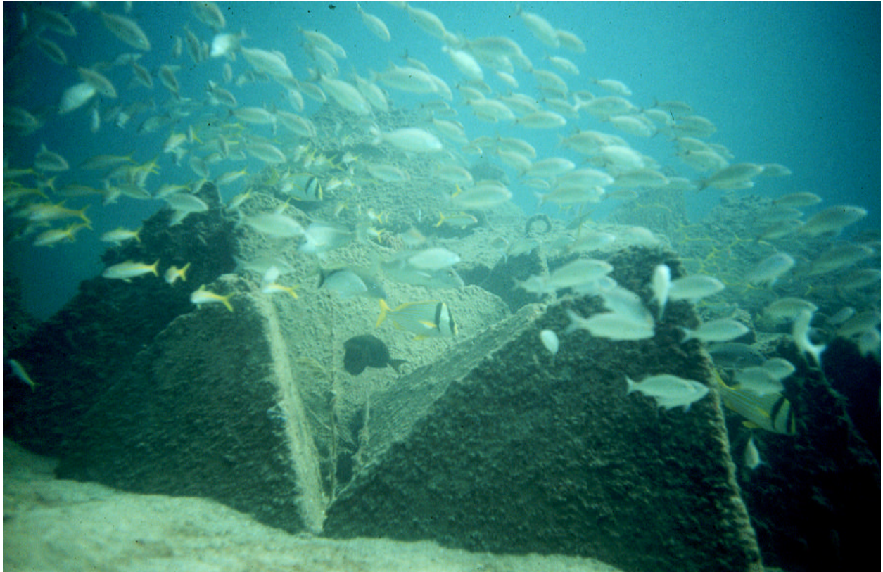
Figure 2. "Tetrahedrons" are commercial modules that stack in a stable configuration and offer multiple-size interstices