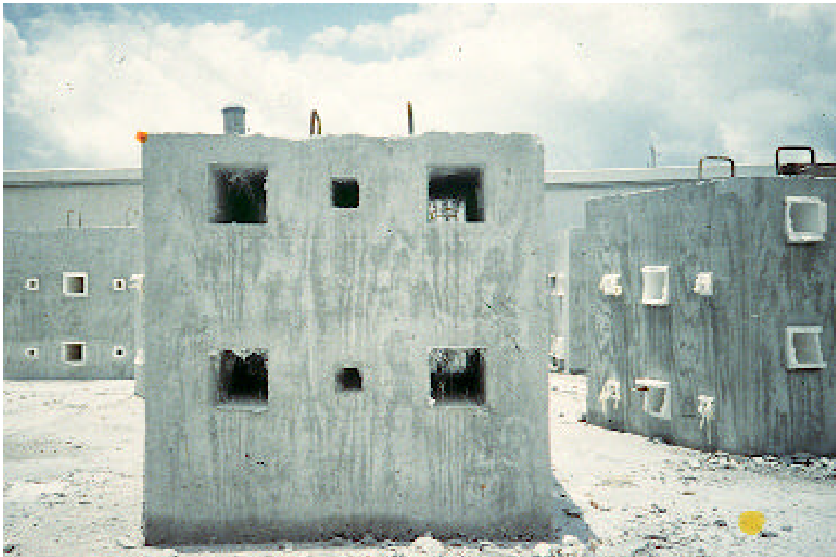
Figure 5. “Swiss cheese” module, is a cubic meter of waste concrete with 12 tunnels running through the block from side-to-side. The tunnels differ in size (see Study 5). This design was selected, from the literature, to examine the role of complexity and allow a comparison of the Broward marine environment with studies done elsewhere.