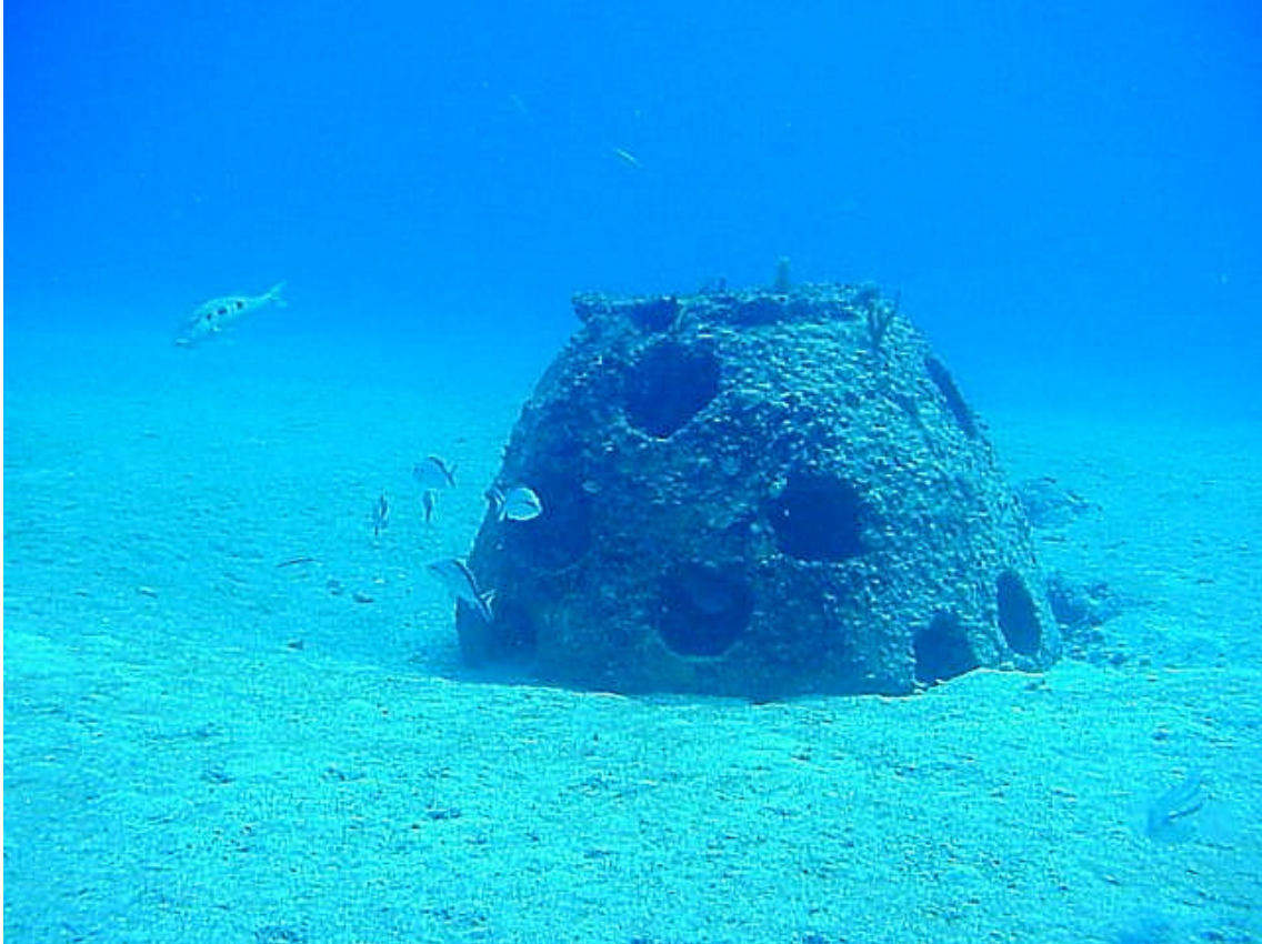
Figure 3. “Reef Ball™” module, is a commercial module, readily manufactured in replicate and easy to deploy.